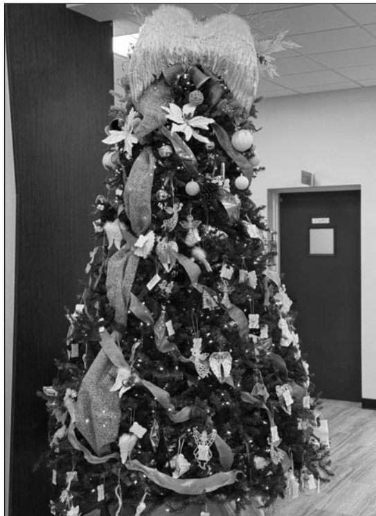
ABOVE: the Tree of Angels in Palo Pinto County. ABOVE RIGHT: The staff of the DA's Office in Williamson County. RIGHT: The Williamson County Honor Guard at the Tree of Angels ceremony.