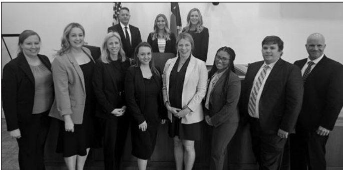
At left and below are attendees at our Advanced Trial Advocacy Course at Baylor School of Law.

To date, the course has been delivered to 392 supervisor-level prosecutors. Other courses are currently scheduled, and even more offices have expressed a desire to attend it.